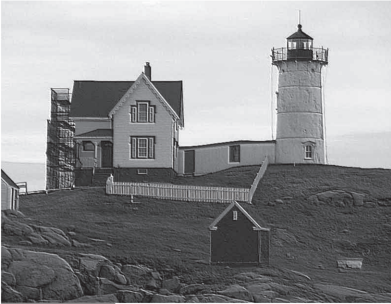
The Coast of Maine

overlooking the sea. I ordered a chicken wrap while the three ladies enjoyed seafood. After the meal we walked along the Marginal Way, a trail skirting the wave-washed coast. We experienced great weather with picturesque views. Finally, it was time to part company. I headed north with Jody, while the three women returned south.