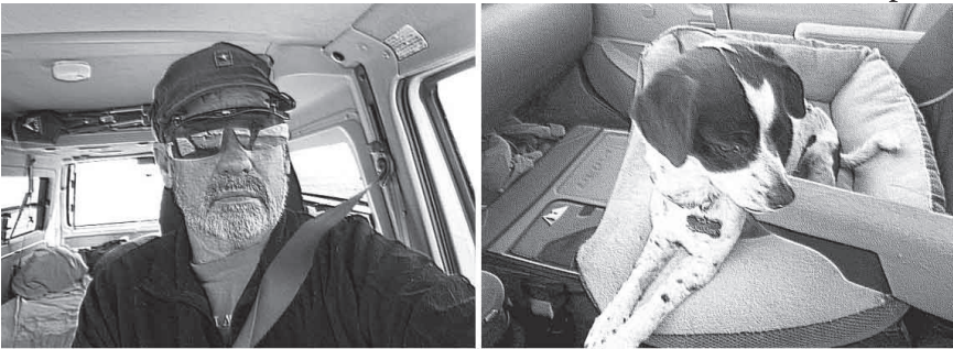
Two Road Warriors

General Helmuth von Moltke once remarked, "No battle plan