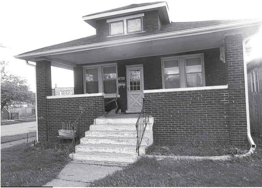
The Old House

I walked around the block, reciting the names of the people who had once lived in the houses. In my day, the occupants were ninety percent Polish and Slovak. Now most of the locals appeared to be Latino. The streets seemed so different, so familiar, so far from my current estate, so close to the estate of my heart.